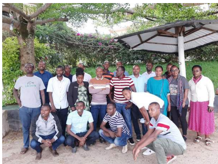
Group photo with group one at the entomology sentinel sites in the Eastern Province, Rwanda

In line with PAMCA vision of “An Africa free of vector- borne diseases,” PAMCA conducted an in-field training on Mosquito Database Management System (MosquitoDB), for Rwanda Biomedical Centre (RBC) Vector Control Unit (VCU) from the September 27- October 8, 2021. The training was sponsored by Bayer and targeted 7 entomology sentinel sites in Western, Northern, and Southern Provinces and 5 entomology sentinel sites in the Eastern Province and Kigali City. Dr. Samson Kiware, PAMCA’s Program - Knowledge Management, in collaboration with RBC VCU – trainee of trainers (ToTs) conducted the 1st and 2nd field trainings in Karongi and Rwamagana.