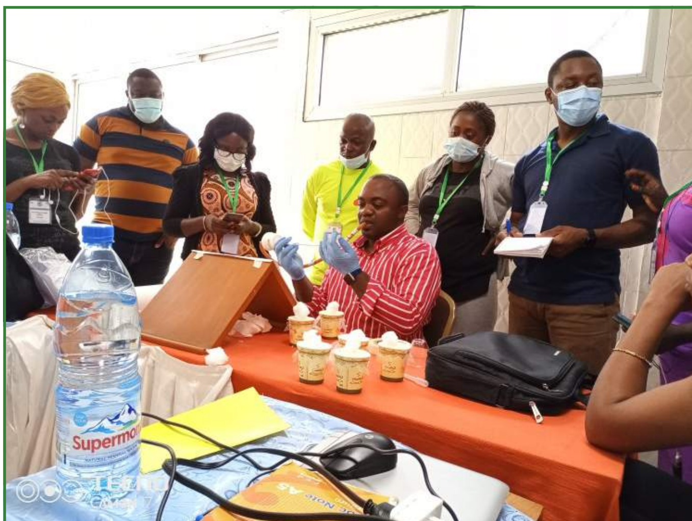
The district entomologist training, practical session, Cameroon Edition

The course facilitators were drawn from universities, NMCP staff, Clinton Health Access Initiative (CHAI), researchers and technicians from IRSS and CNRFP. Following the conclusion of the first round of trainings, the facilitators are currently conducting follow-up engagements with the participants who took part in the trainings to gather feedback, assess the effectiveness of the training regime to inform subsequent future designs, and to assess the impact of the trainings on vector surveillance and control operations.