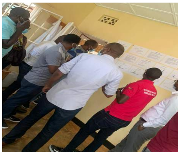
Group two field visit to the entomology centre, Rwanda