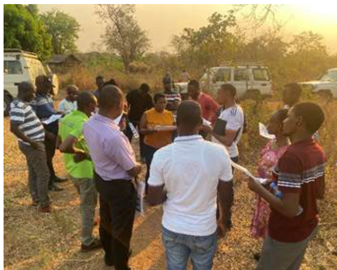
The district entomologist training session, field visit, Burkina Faso

PAMCA, in partnership with three African infectious disease research institutions, dubbed Centres of Excellence, namely Ifakara Health Institute (IHI) - Tanzania, Centre for Research in Infectious Diseases (CRID) - Cameroon, Research Institute of Health Sciences (IRSS) – Burkina Faso; are working to build the capacity of national programs to conduct effective vector surveillance through training of district level entomologists starting with the three countries in which the Centres of Excellence are domiciled. The main objective is to build a critical mass of trained staff at the district level who will be at the disposal of national programs to conduct baseline entomological surveillance and monitoring to guide rational disease control interventions.