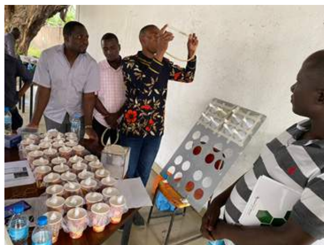
The district entomologist training, practical session, Cameroon Edition.

The course curriculum development was led by IHI in partnership with IRSS, CRID and PAMCA with input from selected national malaria control program staff (NMCPs). The curriculum is designed to cover these key concepts within the shortest period but with a ripple effect of immediate adaptability and transferability by the district entomologists to their everyday surveillance activities. The courses run for two weeks (with a 10-day intensive residential training schedule) and consist of theoretical modules that are reinforced through practical laboratory sessions, as well as practical field demonstration components conducted within partner institutions and field sites. The trainings are conducted in close collaboration with the national programs, and PAMCA Country Chapter leadership and target disease implementers drawn from the programs (malaria focal persons and surveillance officers) to ensure immediate benefit of the training outcomes to disease intervention implementation initiatives with the countries.